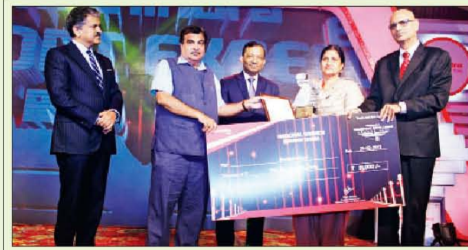
HIGHWAY DHABA CATEGORY: WINNER - Dashmesh Punjabi Dhaba (South); REGIONAL WINNERS - Hotel Shree Dev Narayan (North); Shukla Hotel (East); Babbi Da Dhaba (West)

CATEGORY: WINNER - Sri Venkateshwara Auto Agencies (South); REGIONAL WINNERS - Ganga Nagar Motors (North); Maini Motors (West); Bharadwaj Motors (East Zone)