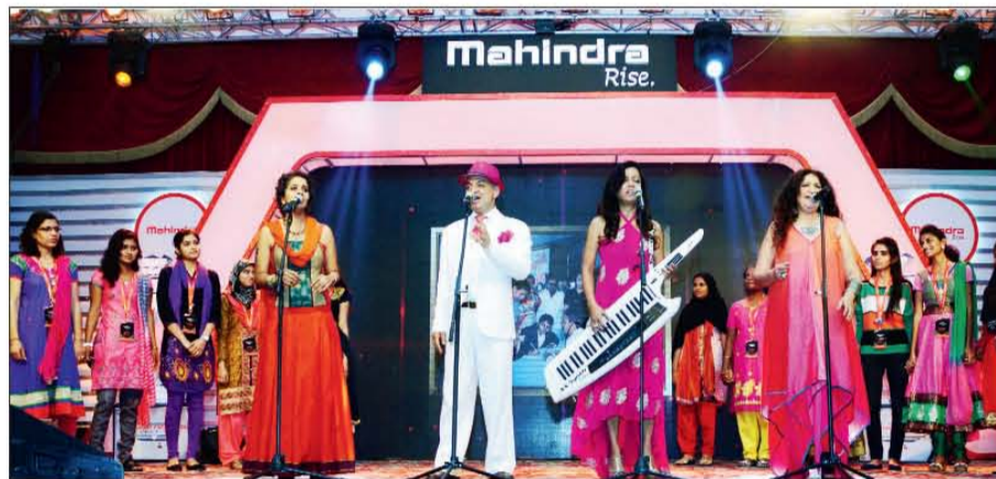
Some of the daughters of truck drivers from different parts of the country, who were awarded the Saarthi Abhiyan scholarships participated in the performance of a special song - the Mahindra Rise Anthem

stituents of the transport community with significantly higher interest leading to increase in entries collected - over 2300 entries (with multiple case studies for different categories) - 20 percent more than last year, were received for its 4th edition. The entries boast-