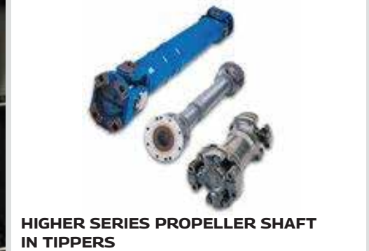
HIGHER SERIES PROPELLER SHAFT IN TIPPERS