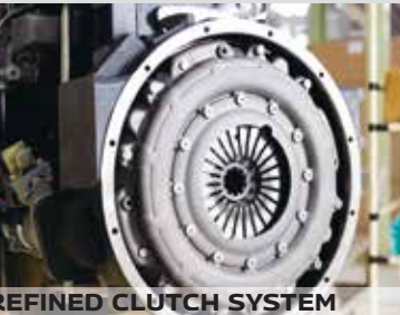
REFINED CLUTCH SYSTEM