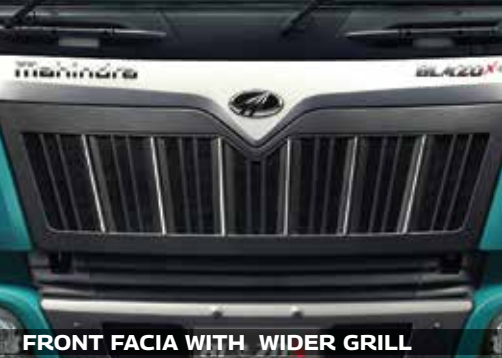
FRONT FACIA WITH WIDER GRILL

mahindra iMAXX TRACK YOUR TRUCK FROM ANYWHERE WITH MAHINDRA iMAXX TELEMATICS TECHNOLOGY.