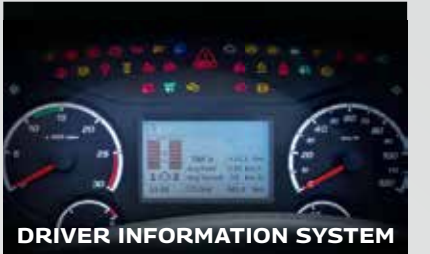
DRIVER INFORMATION SYSTEM