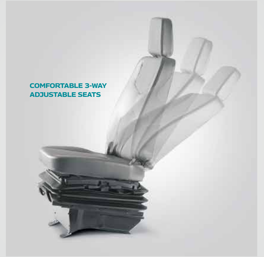
COMFORTABLE 3-WAY ADJUSTABLE SEATS

Note: In view of our policy of continuously improving our products, we reserve the right to alter specifications or design without prior notice and without liability. Illustrations do not necessarily show the vehicle in its standard form. Accessories shown are not part of the standard equipment. Colour shades shown may vary. E. & O.E.