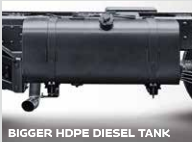
BIGGER HDPE DIESEL TANK