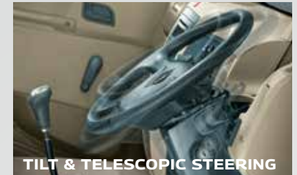
TILT & TELESCOPIC STEERING