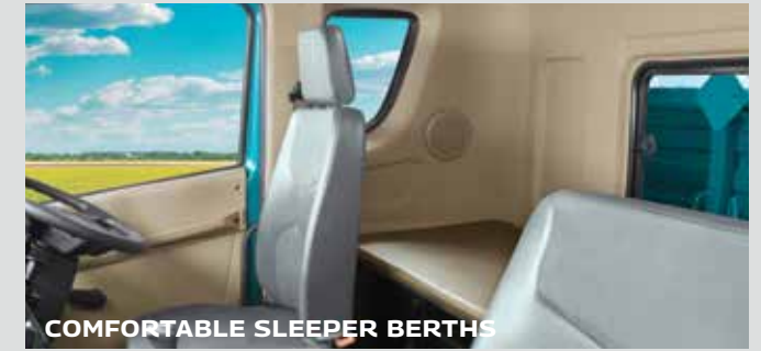
COMFORTABLE SLEEPER BERTHS