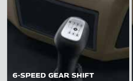
6-SPEED GEAR SHIFT