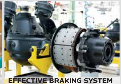
EFFECTIVE BRAKING SYSTEM