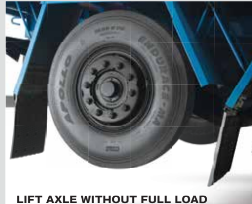
LIFT AXLE WITHOUT FULL LOAD