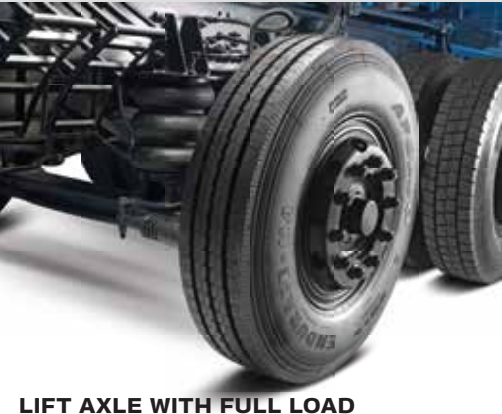
LIFT AXLE WITH FULL LOAD