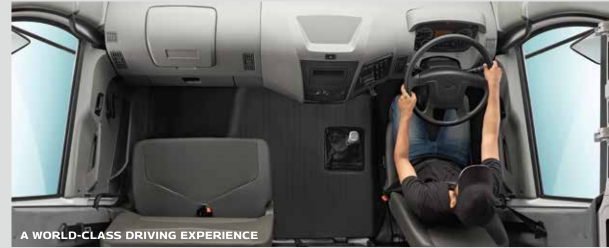
A WORLD-CLASS DRIVING EXPERIENCE

Mahindra BLAZO X is one of the most comfortable truck in India. It's built with the knowledge that drivers are the actual wheels of Indian transport and they spend half their lives inside the cabin. Which is why this truck comes with a host of features to make every drive more safe and comfortable. Like the 4-point suspended cabin that truly enhances driving comfort. And the controls that are ergonomically located to reduce effort inside the cabin.