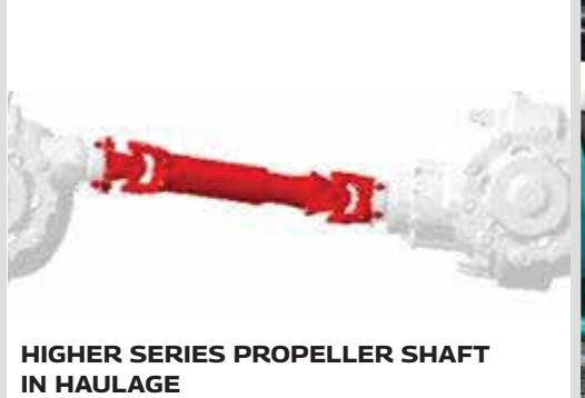
HIGHER SERIES PROPELLER SHAFT IN HAULAGE