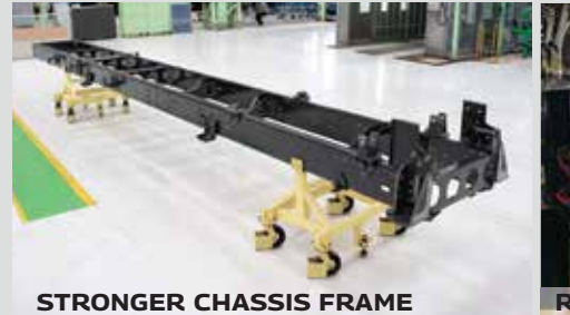
STRONGER CHASSIS FRAME