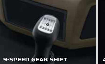
9-SPEED GEAR SHIFT