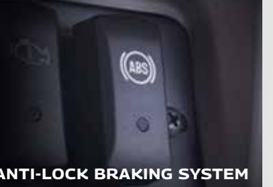
ANTI-LOCK BRAKING SYSTEM