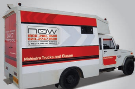
Mobile service van