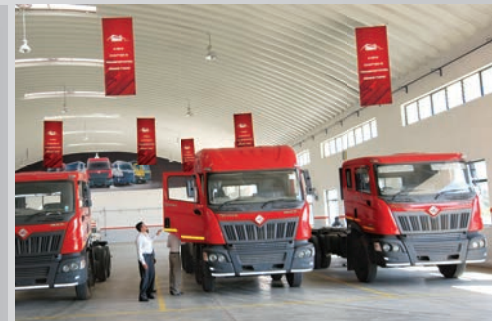
Fully covered workshop