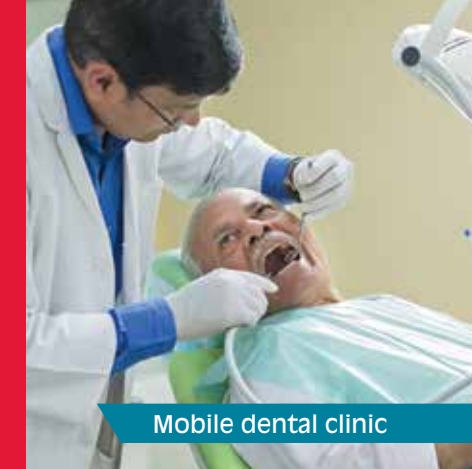
Mobile dental clinic