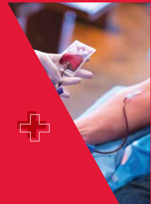
Blood donation van