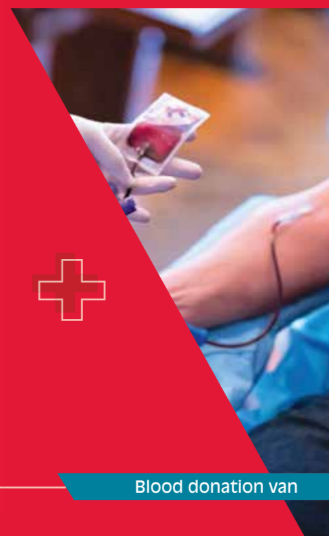
Blood donation van